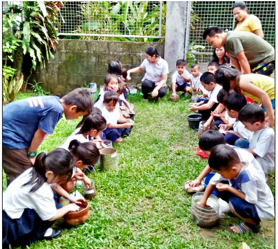
They learn the value of keeping the environment green with class planting projects which their parents help supervise. "Magtanim ay di biro" but it certainly is a lot of fun!

We gave them crayons and paper and asked them to draw "anything". The results were amazing! The children's artwork will be featured in the SET Graphics 2018 calendar which will be available this December.